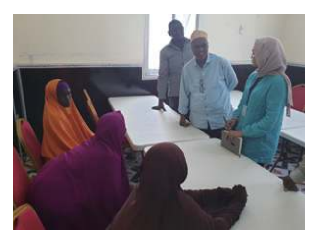
WHO staff interact with female patients in Somalia, where there is a need to increase the number of female health professionals working in leprosy.

Case finding, treatment gather pace as government renews focus on leprosy.